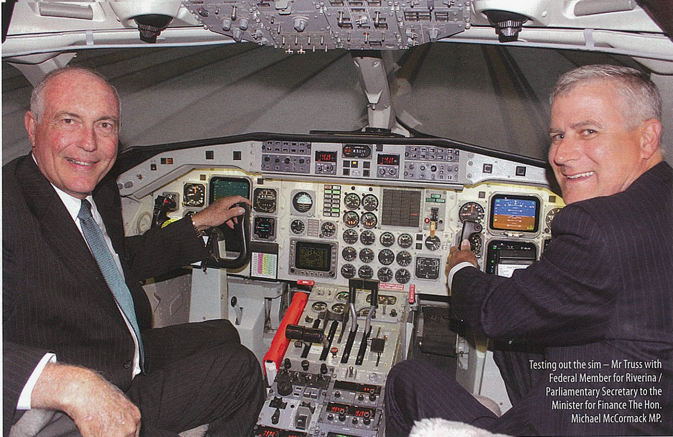
Testing out the sim – Mr Truss with Federal Member for Riverina / Parliamentary Secretary to the Minister for Finance The Hon. Michael McCormack MP.

prepares the pilot for a raft of abnormal and emergency scenarios in a safe and controlled environment. This demonstrates the absolute commitment Rex has for safety and to ensuring the highest possible training standards.”